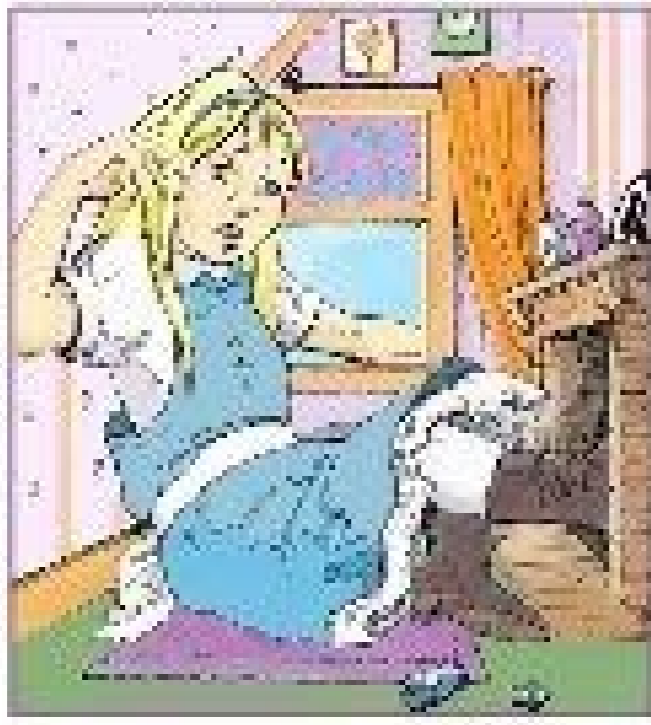
Copyright © 2014 by Scholastic Teaching Resources. All rights reserved. This work is derived from Alice's Adventures in Wonderland.

"You need the Rabbit's pocket gloves, and called to her, in an angry tone. "Why, Mary Ann, what are you doing out here?" But when she looked and found a pair of gloves and a tin of Quack, she said, "The gloves are for his boots!" and Alice, in the next of. "How surprised he'll be when he finds out who I am!" As she said this, she came upon a small table, on the cloth of which was a fragile paper plate with the name "R. B. B. B. B." impressed upon it. She went to it without knowing what it meant, for great fear had seized upon the poor little girl, and she had been so long in the pocket that she had forgotten the name of the little table.